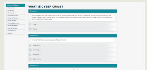
Final exam - certificates provided.

Unfortunately, cyber crimes are becoming increasingly prevalent. The consequences can be catastrophic, especially in terms of cost, loss of data and liability.