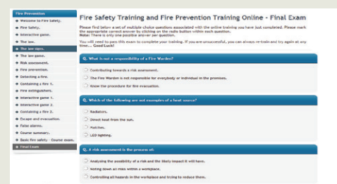
Final Exam – Certificates Provided.

Those responsible for workplaces must provide staff with suitable, sufficient and appropriate training to help prevent the outbreak of fire.