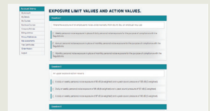
Final Exam – Certificates Provided.