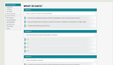
Final Exam – Certificates Provided.

*The number of Carpal tunnel syndrome cases includes cases caused by repetitive movement of the wrist. It is not possible to separate the vibration-related and repetitive-movement-related cases of Carpal tunnel syndrome (The Injuries Disablement Benefit Scheme).